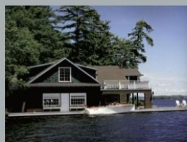
living on the water