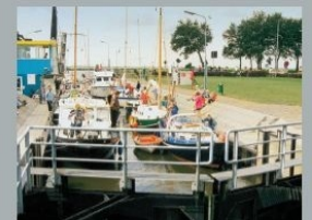
tourism and leisure