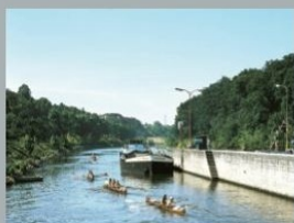
water sports and fishing