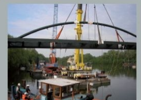
European funds and employment