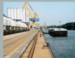
economical and ecological transportation